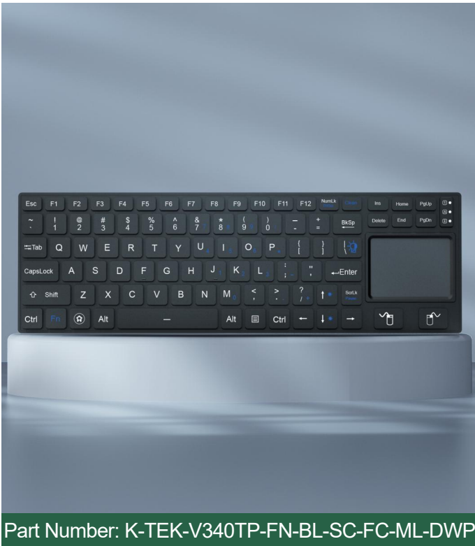
Part Number: K-TEK-V340TP-FN-BL-SC-FC-ML-DWP