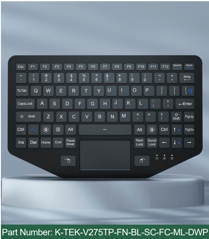
Part Number: K-TEK-V275TP-FN-BL-SC-FC-ML-DWP