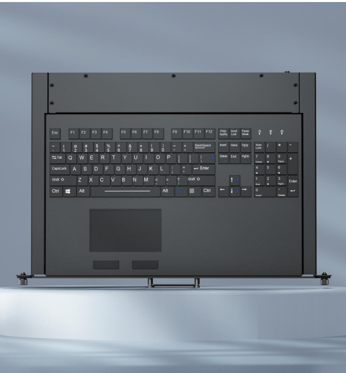
Part Number: K-TEK-V440TP-KP-FN-BL-SC-DR