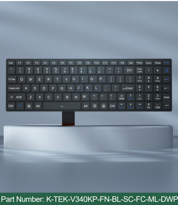
Part Number: K-TEK-V340KP-FN-BL-SC-FC-ML-DWP