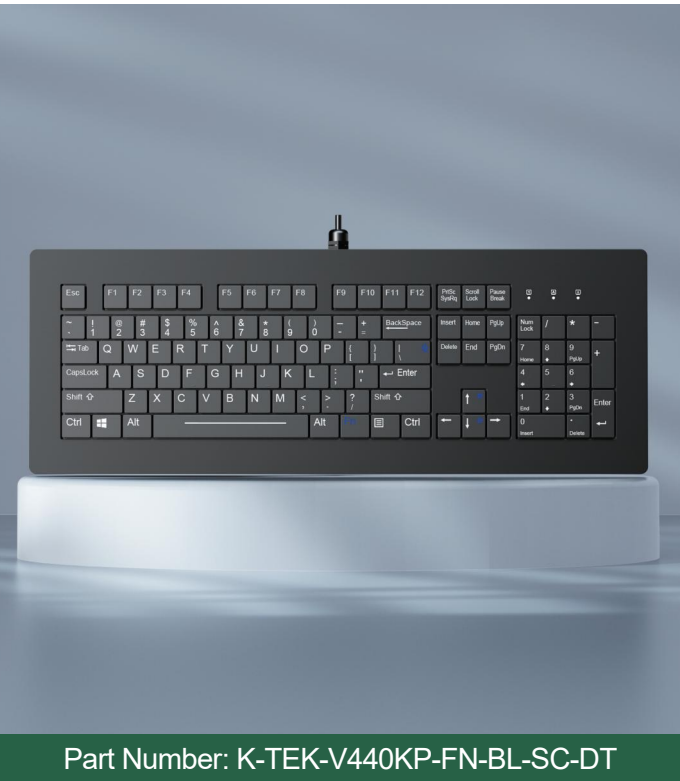
Part Number: K-TEK-V440KP-FN-BL-SC-DT