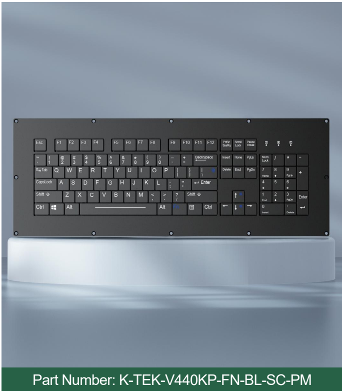
Part Number: K-TEK-V440KP-FN-BL-SC-PM