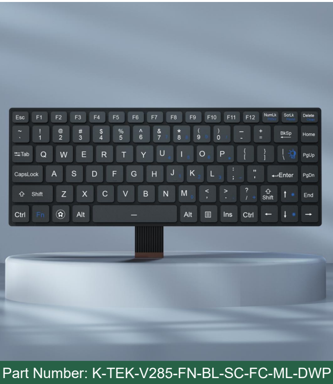
Part Number: K-TEK-V285-FN-BL-SC-FC-ML-DWP